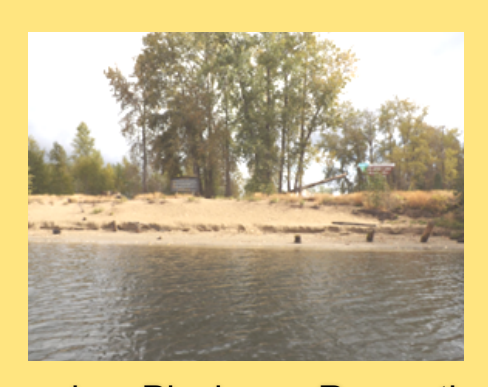
Camping, Playing or Recreating in Contaminated Soil or on Shorelines