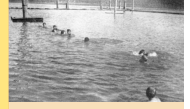
Prior to the release of mine waste contamination, swimming in the Lower Coeur d'Alene River was a common practice among the Tribe. Today, Tribal members are confined to swim in uncontaminated areas in the Coeur d'Alene Basin.

The Schitsu'umsh, "those who were found here" (The Coeur d'Alene Tribe) have long used the Basin for every aspect of their lives and they view this land as given to them by the Creator. Today, the Tribe maintains a strong spiritual connection to their aboriginal territory.