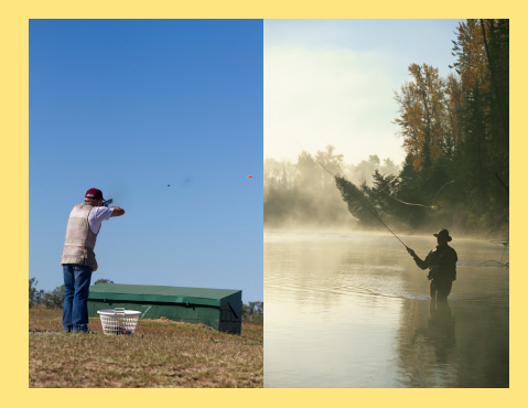
Fishing with Lead Weights or Shooting with Lead Ammunition